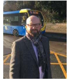
Ged with the D1

Time is running out, so we must invest in climate action now to build a low carbon economy. Across Ireland we will invest in public transport and cycling, give grants for electric vehicles, and start an insulation programme for 100,000 homes a year, creating local jobs, lower energy bills and warmer homes.