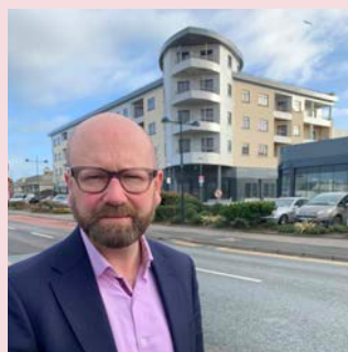
Let's get the Bettystown Primary Care Centre open

More of our taxes than ever before are going into health spending, but the government still gives us record overcrowding and long waiting lists. We can fix this – with more hospital beds and by ending the staff recruitment embargo. We can care for more people at home by providing enough funding for home-help and respite care, and we will train more GPs so every community has access to a doctor.